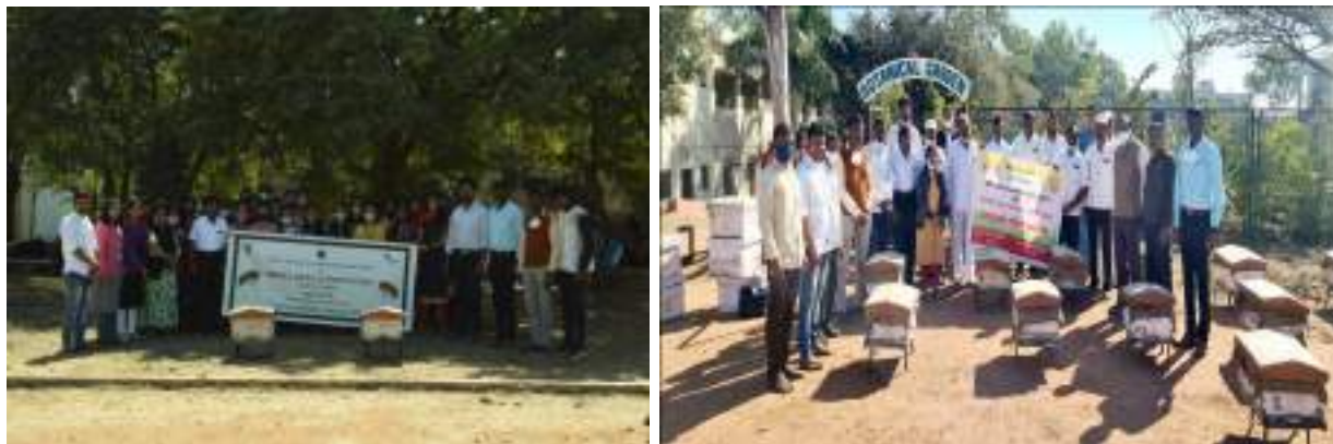
Hands on Training on Honey bee handling organised on 2 nd February, 2022 in Waghire College campus

Under the funding of the DBT-STAR College Scheme, the Zoology department of Waghire College, Saswad organized Hands on Training on Honey Bee handling for the Teaching and Non-teaching staff of Zoology department, S.Y.B. Sc Zoology students and nearby farmers on 2 nd February, 2022.