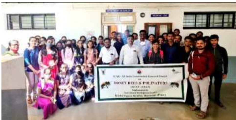
Feedback and Valedictory function of Workshop on Honey Bee handling and Practical's related to it