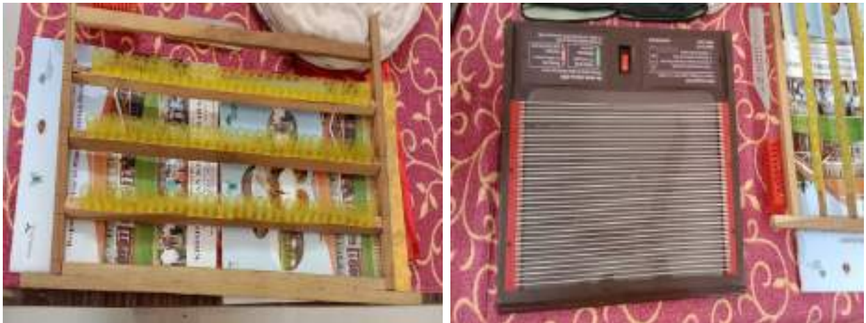
Artificial Queen rearing and Royal jelly collection cups Pollen traps used for pollen collection from honeybees

He also explained the beeswax extraction, bee venom extraction, royal jelly extraction and pollen extraction by showing the students the pollen trap used for extracting pollens loaded by honeybees and rearing cups used for artificial queen rearing process and collection of royal jelly.