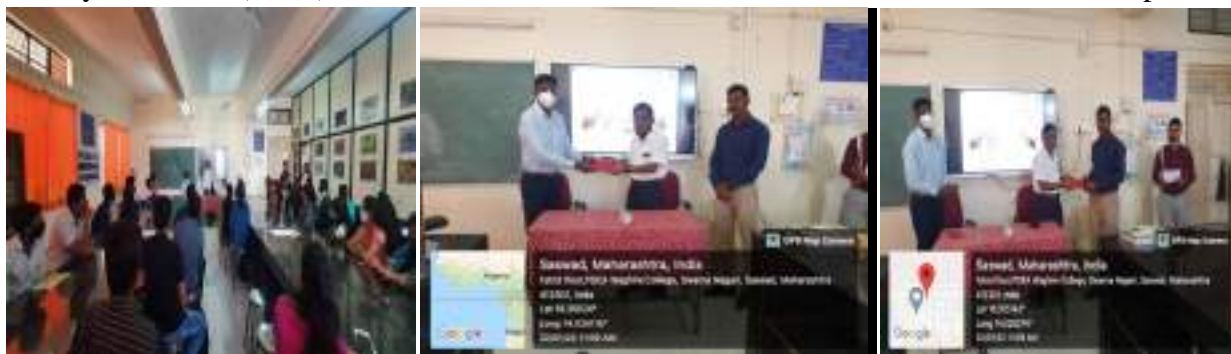
Inauguration of One day Workshop and Felicitation of Resource persons