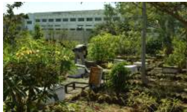
Hiving process of Bee colonies obtained from KVK, Baramati in New Departmental Bee boxes

After the hiving process, the resource people explained the difference between Ripe and Unripe honey and showed the process of Honey extraction from sealed honey comb frames. The assembled mob devoured the sweet honey after the honey extraction process. During all these process the use of the beekeeping equipments like Hive tool, Bee-veil, Overall, gloves, Bee boxes, smoker etc. procured by the Zoology department under the DBT STAR College Scheme was done.